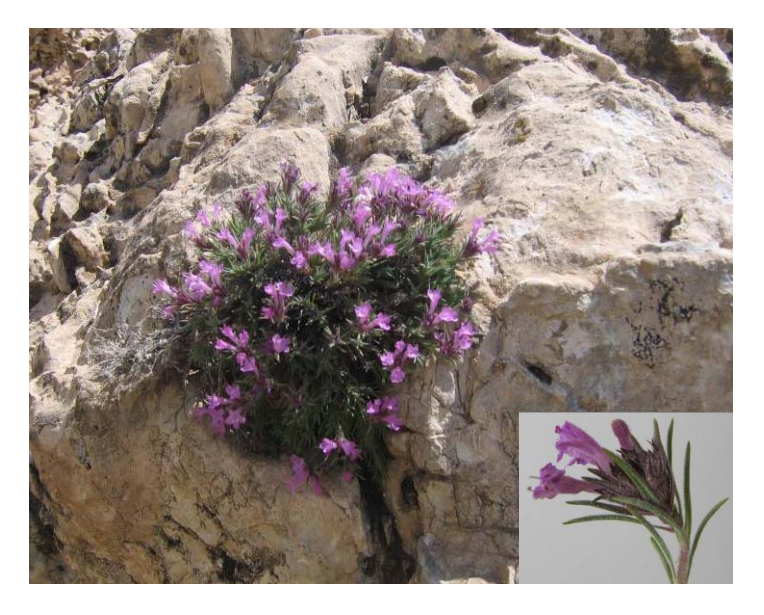
Fig.1. Thymus persicus in its natural habitat (Takab: Baderlu). Scale bar=1 cm.

average standard deviation of split frequencies was approaching a value of 0.01 as suggested by Ronquist & al. (2005). After discarding the first 25% of trees as burn-in, a 50%-majority-rule consensus tree of the remaining trees was computed accompanied with posterior probability ( PP ) values for individual clades. Tree visualization was carried out using Tree View version 1.6.6 (Page, 2001).