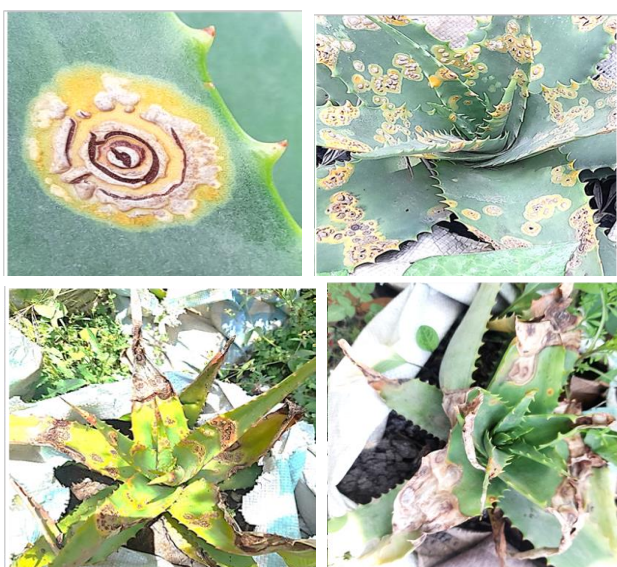
Fig. 1 Uromyces aloes rust disease symptoms with varying degrees of severity on A. vera leaves as observed in the survey fields

Microscopic examination showed that the teliospores and Urediniospores of U. aloes exhibit distinct morphological characteristics of U. aloes . Teliospores were observed with single-celled, hyaline, concentric, ringed, ovoid, often irregular and rounded apex [5, 6] 13.7-19.6 x 11-24 µm, verrucose wall-1.8 µm thick with long hyaline pedicles or spikes 1.3-2.3 to 3.5-6.4 µm at the tip (Fig. 2). The Urediniospores were light brown and globular in shape, surrounded by a visible pigmented wall measuring around 15–20 × 18–26 µm which is in line with [7]. Based on microscopic features, the fungus was identified as U. aloes (Cooke) Magnus, which has not been previously properly identified and reported from Ethiopia to date.