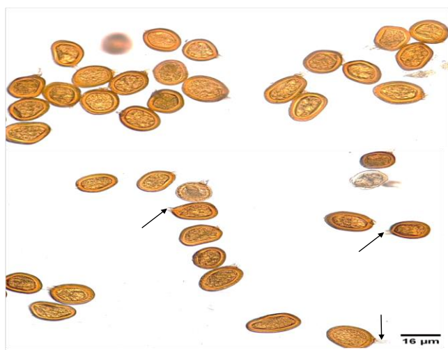
Fig. 2 Fungal Urediniospores and teliospores with spikes (arrows) of U. aloes identified from diseased A. vera samples as seen under the Olympus fluorescent digital microscope BX53 (Japan).

Uromyces (Link) Unger, a genus of rust fungi, proposed by Unger in 1833 are the causal agent of rust diseases on various agricultural, horticultural, and forest plantation trees [4]. The