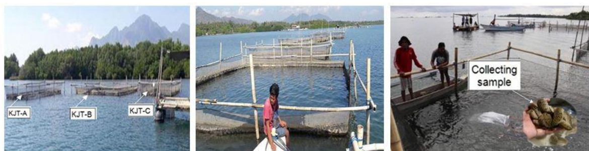
Figure 1: Sea pens (KJT) used for sea cucumber rearing.

water discharged from intensive shrimp ponds that could affect the characteristics of seafloor sediment. The three 10 \times 5 \text{ m}^2 sea pens (KJT), namely KJT-A, KJT-B, and KJT-C, with a 3-m height net, were installed at the site using bamboo and plugged into the seabed to support the net. Nylon nets with a mesh size of 5 mm were used, and its lower edge was held using a bamboo frame. The net was fitted to the seafloor, buried to a depth of 20 cm, and pressed tightly using a sand-sack weight to prevent sea cucumber from escaping (Fig. 1). Before the seeds were stocked, predatory animals inside the pen such as crabs and starfish were removed.