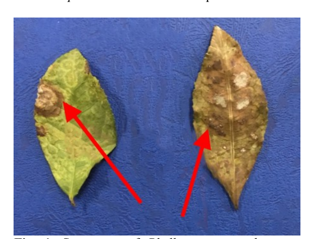
Fig. 1. Symptoms of Phyllosticta capitalensis on leaves of Camellia sinensis .

To fulfill the morphological approach and field observations, samples were collected during the summer and autumn of 2017 from tea gardens in Guilan Province, Iran. All tea leaves were then examined for pycnidia of Phyllosticta. When pycnidia were detected, small sections of leaves (0.5 \times 0.5 \text{ cm}) were prepared from the boundary between the infected and healthy tissue. The sections were submerged in a 0.5% sodium hypochlorite solution for approximately five minutes, rinsed in sterile distilled water, and placed on sterile filter paper to dry. They were then transferred onto Potato-Dextrose-Agar (PDA) culture medium at 20 °C with a 12-hour photoperiod (van der Aa 1973). Additionally, to compare the morphology of the colonies with available descriptions on the Pine-Needle-Agar (PNA) culture medium, all isolates were cultivated on this medium and exposed to near-UV light at 27 °C with a 12-hour photoperiod. After 14 days, microscopic slides were prepared, and a comparison with P. capitalensis was conducted performed.