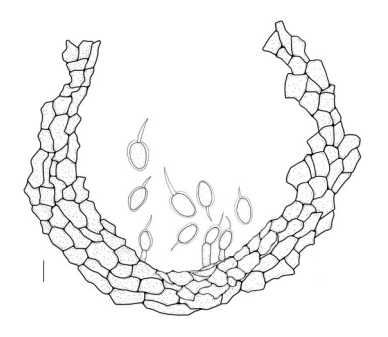
Fig. 2. Conidia and conidiogenous cells of Phyllosticta capitalensis on leaves of Camellia sinensis . Scale bar= 10 μm.

The phylogeny was inferred using Bayesian analysis in the program BEAST version 2 (Bouckaert et al. 2019) using a Yule tree prior (Gernhard 2008) and a strict molecular clock. A single MCMC (Markov chain Monte Carlo) chain was run, with a burn-in of 10%. Posterior probabilities were calculated from the remaining 9,000 sampled trees. A maximum clade credibility tree was produced using TreeAnnotator (part of the BEAST package). The resulting tree was visualized using FigTree version 1.4.4 (Rambaut 2018).