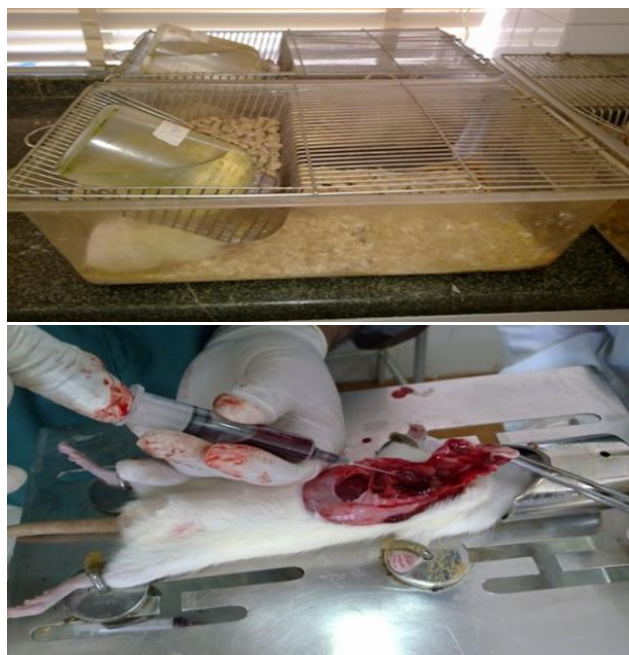
Fig. 1 Laboratory rat housing and blood sampling procedure