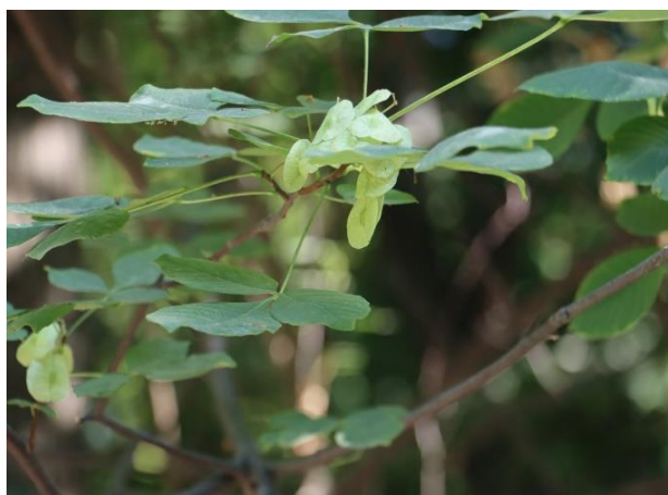
Fig. 2 P. trifoliata . Specimen from the Tashkent Botanical Garden, Tashkent. Photo by A.T. Khazratov, taken on 23 August 2024

P. trifoliata L. (Rutaceae), common hoptree or water ash (PT). The plant is a small tree or often a shrub with a few spreading stems, typically reaching a height of 6–8 m and forming a broad crown. The fully grown leaves are dark green and glossy on the upper surface, with a paler green underside. In autumn, the leaves transition to a rusty yellow color. The flowers are small, measuring 1–2 cm across, and have 4–5 narrow, greenish-white petals. The fruit is a round, wafer-like, papery samara, 2–2.5 cm in diameter, light brown in color, and contains two seeds. The fruit ripens in October and remains on the tree until high winds dislodge them in early winter [51 - 56] (Fig. 2).