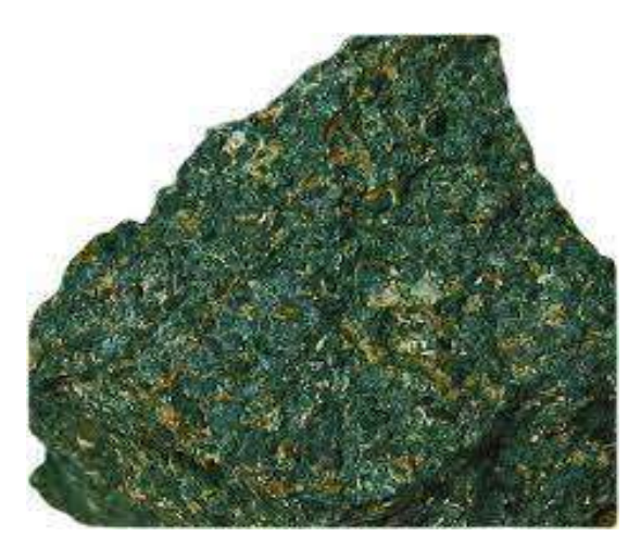
Figure 1. View of Glauconite Stone.

Glauconite is composed of a rich blend of minerals, including iron oxide, aluminium oxide, and potassium oxide. These elements, arranged in a layered structure, provide a multifaceted defense against radiation (3). First, iron oxide gives glauconites a high density, enabling them to effectively absorb radiation by converting its energy into heat. Second, the layered structure of these minerals disrupts the radiation's path, scattering it in different directions and reducing its ability to interact with cellular components (4, 5). The protective mechanism of glauconites extends beyond absorption and scattering. They can also act as a physical barrier, preventing radiation from directly interacting with cells. Glauconites' ability to form aggregates, or clusters, further enhances their shielding efficacy. These aggregates create a dense network that deflects radiation effectively, minimizing its exposure to cells (6). The potential benefits of glauconite's anti-radiation properties extend beyond shielding cells from external sources of radiation. These minerals also exhibit a remarkable ability to protect cells from radiationinduced damage. Studies have shown that glauconites can reduce the formation of DNA breaks, which are a hallmark of radiation-induced cell injury. Additionally, glauconites can modulate the expression of genes involved in radiation response pathways, thereby mitigating the harmful effects of radiation (7).