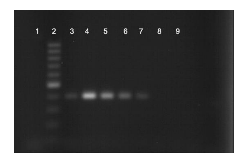
Figure 2. Perform PCR with different dilutions: 1) negative control, 2) markers kb100, 3) dilutions 0.1 ng, 4) Not diluted, 5) 4 ng dilution, 6) 0.4 ng dilution, 7) 0.2 ng dilution, 8) 0.05 ng dilution, and 9) 0.001 ng dilution