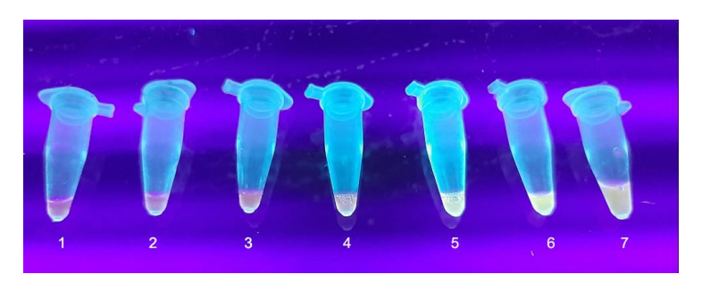
Figure 3 : The LAMP test was conducted with varying dilutions: 1) negative control, 2) 0.05 ng dilution, 3) 0.1 ng dilution, 4) 0.2 ng dilution, 5) 0.4 ng dilution, 6) 4 ng dilution, and 7) undiluted.