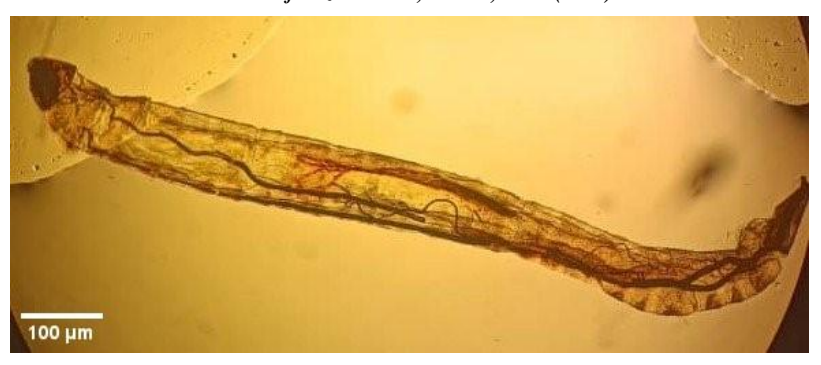
Figure 1. P. albipennis. larvae collected from patients' urogenital tract under microscopic magnifacation.