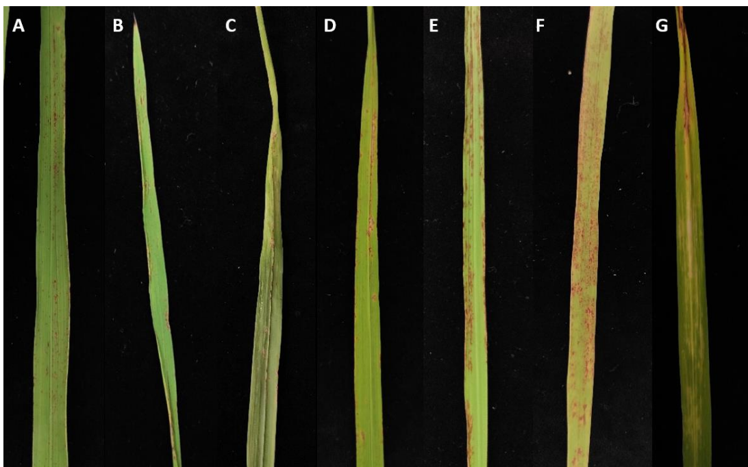
Fig 1. Reactions of rice to Pyricularia oryzae , at the three-leaf stage, to inoculations with 10^5 conidia/ml containing Tween 20 suspension of IMT8 isolate at 6 days after inoculation and maintaining in the greenhouse with a 12/12 light and dark period and 75-95% relative humidity. A) Hashemi, B) Alikazemi, C) Domsiyah, D) Sang Tarom, E) Champa, F) Binam, G) Tarom Mahali.