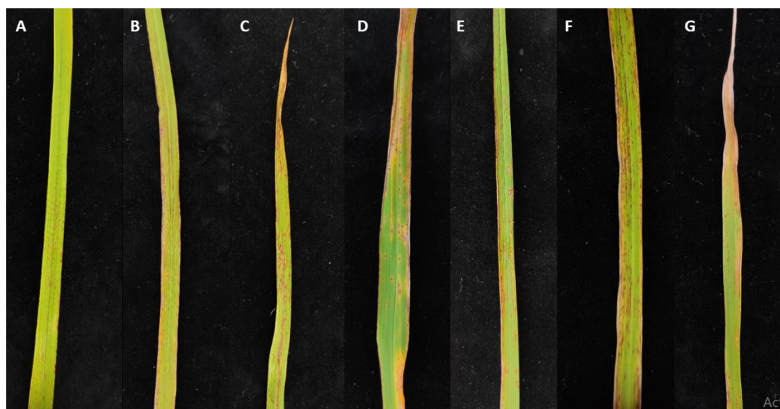
Fig 2. Reactions of rice Pyricularia oryzae , at the three-leaf stage, to inoculations with 10^5 conidia/ml containing Tween 20 suspension of IMT8 isolate at 10 days after inoculation and maintaining in the greenhouse with a 12/12 light and dark period and 75-95% relative humidity. A) Hashemi, B) Alikazemi, C) Domsiyah, D) Sang Tarom, E) Champa, F) Binam, G) Tarom Mahali.