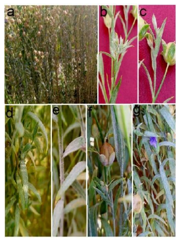
Fig. 1. Symptoms of powdery mildew on flax plant. a. a general view of cultivated plants; b-g. symptoms on different parts of the plant.

comparison and phylogenetic analyses. The phylogenetic tree was obtained using the Minimum Evolution method in MEGA 7.0 (Kumar et al. 2016). Sawadaea koelreuteriae (MT008194) was selected as the outgroup.