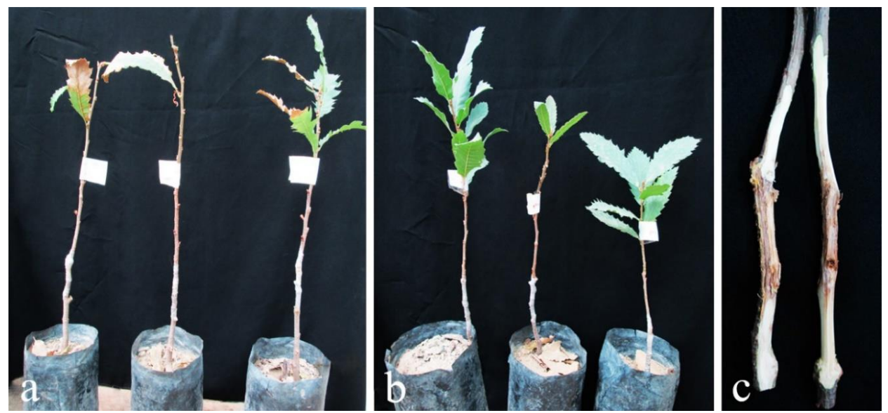
Fig. 3. Disease symptoms caused by Phaeoacremonium tuscanicum on oak seedling in greenhouse conditions. a. inoculated plant after 3 months; b. negative control; c. necrotic lesion expanded upwards and downwards of the inoculated point on the stem internodes.