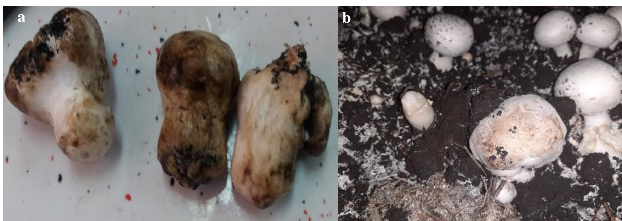
Fig. 1. Agaricus bisporus infected by Lecanicillium fungicola , symptoms of basidiocarp deformation on button mushroom. a. hyperplasia of fruiting bodies and sclerodermoid masses; b. malformation and lack of differentiation

mushroom production fields in Isfahan, Alborz and Khuzestan provinces was performed. In order to culture the pathogen, 200 g of button mushroom caps and 500 mL of sterile distilled water were just mixed and passed through filter paper, 20 mL of the obtained liquid was added to one liter of the PDA medium. Infected samples were surface sterilized using 10% sodium hypochlorite for one minute and then washed three times with sterile distilled water and placed on the above culture medium for 10 days. Moreover, to confirm the morphological identification, DNA extraction was performed by CTAB method and ITS-rDNA regions was amplified and sequenced using specific primers. After morphological and molecular identification, it was found that out of 100 collected samples, 80 samples belonged to L. fungicola (Fig. 2) and only one sample was M. perniciosa (Fig. 3) on the morphological basis. Sequences were registered with number MW737632, MW737629 and MW737630 and it seems that according to the present samplings, the dry bubble disease is predominant in all three provinces. If the disease is not controlled, severe damage will be occurred to the mushroom breeding units. The predominant species has different varieties such as L. fungicola var. fungicola which is common in Europe and L. fungicola var. aleophilum is common in warmer countries and the United States.