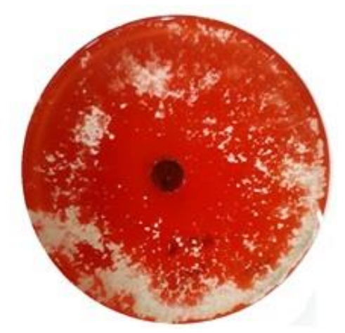
Fig. 1. Isolate T5c ( Trichoderma harzianum ) on CMC medium after coloring with 1% Congo red. Clear zone indicate cellulolytic activity.

The phylogenetic tree was created using the neighbor-joining (NJ) algorithm with a p-distance substitution model and bootstrapping of 1000 replications (Fig. 2). It revealed that the lineages of the isolates could be clustered into three clades, representing different as follows: Trichoderma (T5c and T3) and Aspergillus (Td1) (Fig. 2). The first clade showed 100% bootstrapping to the T. harzianum sequences. The second clade comprised the isolate grouped with 100% bootstrapping to T. viride sequences obtained from NCBI. The third clade contained the isolate grouped to A. flavus sequences obtained from NCBI.