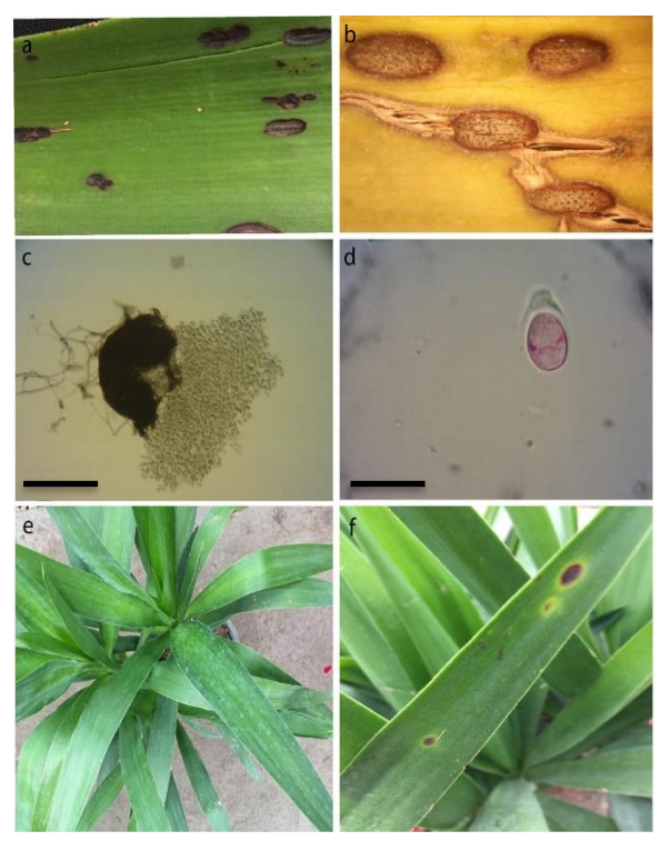
Fig. 1. Leaf spot symptoms on leaves of wild Yucca plants (a-b); Phyllosticta pycnidia (c); conidia (d); non-inoculated plant (e); leaf spot symptoms on leaves two weeks after inoculation (f). — Scale bars = 20 \mu m .

♦ T: Type strain Strains isolated in this study are in boldface.