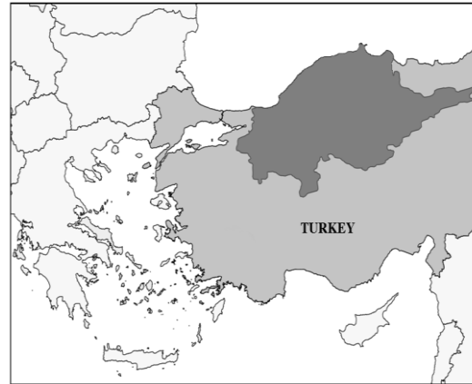
Figure 1: Distribution areas for Capoeta baliki , Capoeta sieboldii and Chondrostoma angorense (dark grey area) as reported by Freyhof (2014a,b,c) (modified).

their distribution range. Currently, there are no data on the population trends of these two species but it is suspected to be slowly declining (Freyhof, 2014 a, b).