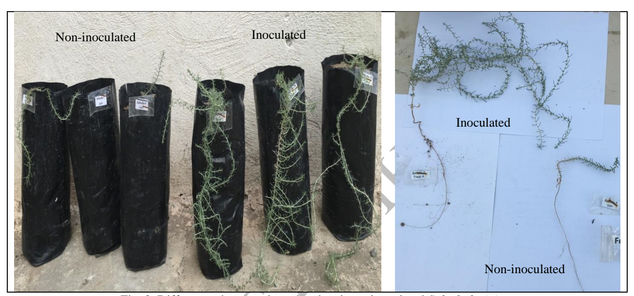
Fig. 3. Differences between inoculated and non-inoculated Salsola laricina.

Values are means of six replicates (S.E.). F-values and significances are given according to one-way ANOVA: *** P<0.001; ** P<0.01. Values marked by the same letter are not significantly different according to Tukey's HSD test