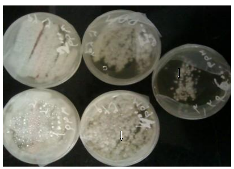
Figure 1: Aspergillus flavus and Penicillium growth on the surface of the nano silver packaging.

After 4 days, the cultivated fungi were detected on the entire sample plates as A. flavus and Penicillium for 1000, 2000 and 4000 ppm of nanosilver coated packages. In the 5000 ppm nano-covered sample, fungi colony growth on 80% of the entire sample plates was observed. In the 6000 ppm nanocoated sample the growth was observed on only 20% of the sample plates (Fig. 1).