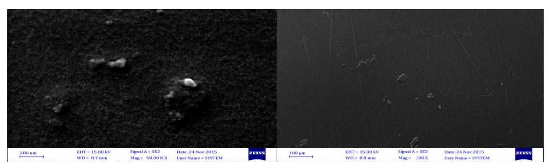
Figure 2: Scanning Electron Microscope (SEM) of nano silver packaging based on TiO_2 shows the average of nano -particles=28nm. a) EHT=15.0, WD=10mm, Mag. =10.0kx b) EHT=15.0, WD=8.7mm, Mag. =50.00 kx c) EHT=15.0, WD=8.8mm, Mag. =100.0 kx d) EHT=15.0, WD=8.7mm, Mag. =50.00 kx.

Particles release by titration method Tested samples coated with silver nano particles showed that there were no silver residues in caviar.