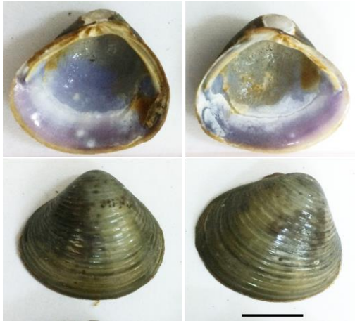
Figure 1: Photos of Corbicula fluminea . Scale bar: 1 mm.

Heavy metals in clam's tissues were extracted as previously reported by Yap et al. (2003) with minor modifications. Briefly, soft clams tissues were homogenized in 2 mL of concentrated nitric acid (75%). After sonication for 3 min, the samples were completely digested with 2 mL of the same solution for 12 h at 80°C. The digested samples were then centrifuged at 4000 rpm for 10 min under room temperature. The supernatant contained metals were kept at -20°C period to analysis.