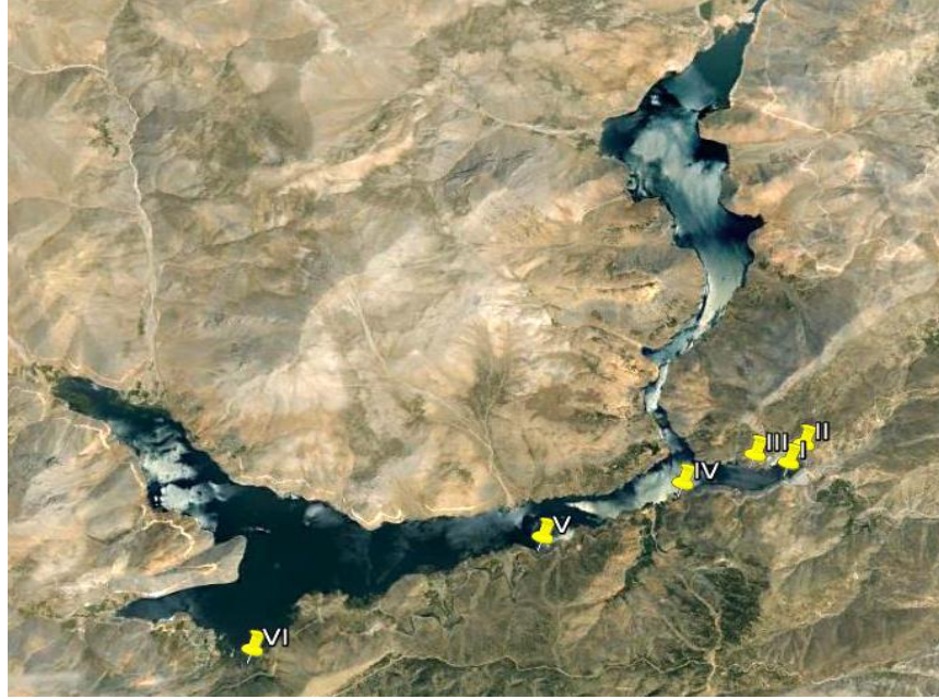
Figure 1: Çat Dam Lake and the sampling stations.