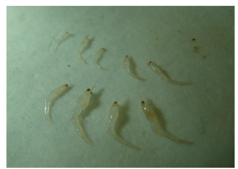
Figure 1: The difference in larval growth rates in treatment C (shrimps in the top row) and treatments A and B (those in bottom row) at the end of experiment period.