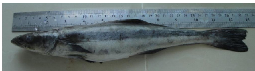
Figure 2: Rachycentron canadum