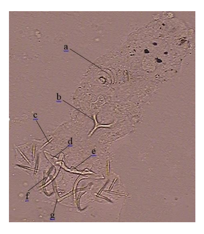
Figure 1: Gonocleithrum cursitans; a: copulatory complex, b: gonadal bar, c: hook, d:Ventral anchor, e: Ventral bar, f: Dorsal anchor, g: Dorsal bar.400X.