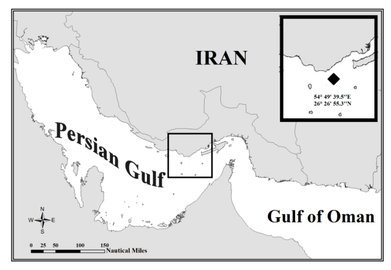
Figure 1: Map of sampling location in the northern Persian Gulf.

morphometric measurements were taken using a dial caliper with an accuracy of 0.02 mm. The data were taken, and recorded based on Nateewathana (1997), Nateewathana et al. (2001) and Aungtonya et al. (2011).