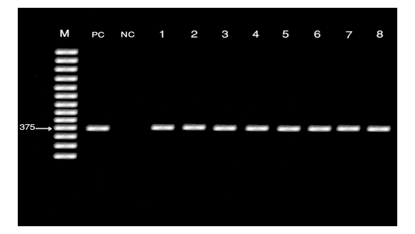
Figure 2. Mycoplasma agalactiae-specific polymerase chain reaction (PCR): PCR electrophoresis analysis in %1 gel agarose, M: marker (100 bp DNA ladder), lane PC: positive control (375 bp, Mycoplasma agalactiae , NCTC 10123), lane NC: negative control (uncultured PPLO broth), lanes 1-8: Mycoplasma genus samples

in this regard, a 24-hour enrichment of Mycoplasma in the appropriate medium greatly facilitates PCR detection even in the presence of bacterial contamination (Nicholas et al., 2008)(Foddai, 2005). In this study, the isolation and identification of Mycoplasma was achieved for the first time in Guilan in the clinically affected small ruminants. The results of this study showed that all of the seven sheep herds (100%) were positive in either PPLO agar or MPCR test. Our findings demonstrated that Mycoplasma was one of the main etiological agents of the contagious agalactia in Guilan province. According to our results,