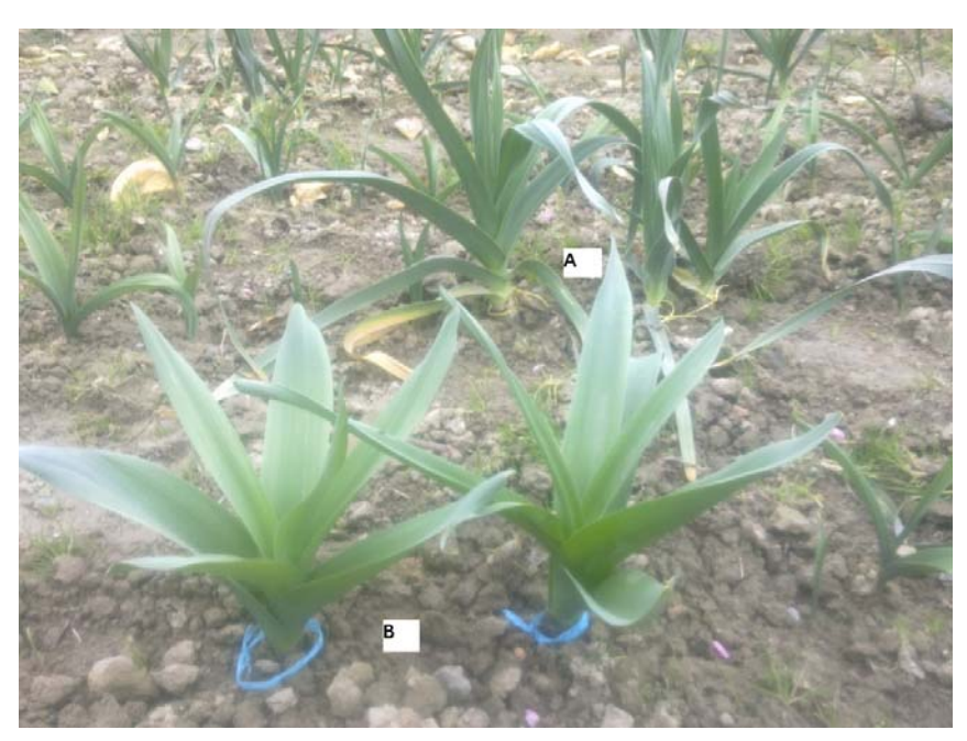
Fig. 1 Genetic diversity of domesticated Allium hirtifolium A= Allium hirtifolium ecotype of Hamedan B= Allium hirtifolium ecotype of Khorasan Razevi (Meshad):

Different letters show significant differences between accession at \alpha =0.01 level