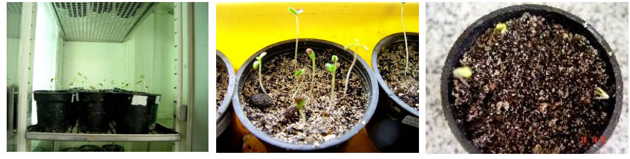
Fig 2. Seed germination in cold room (4 °C) (thermal period) and after transferring to germinator (20 °C)