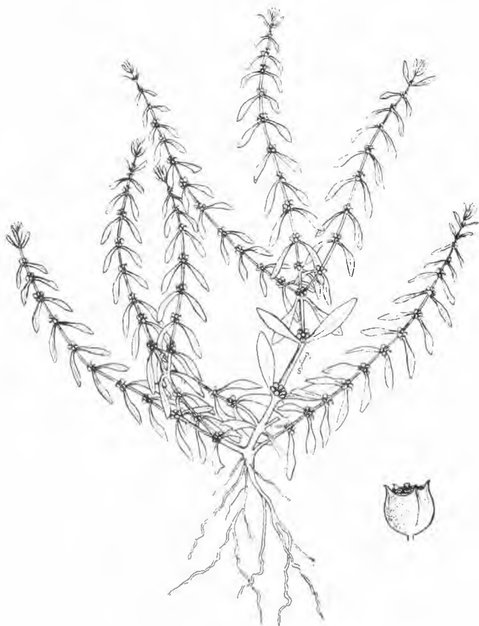
Fig. 2. Ammania verticillata (x0.74); hypanthium (x7).