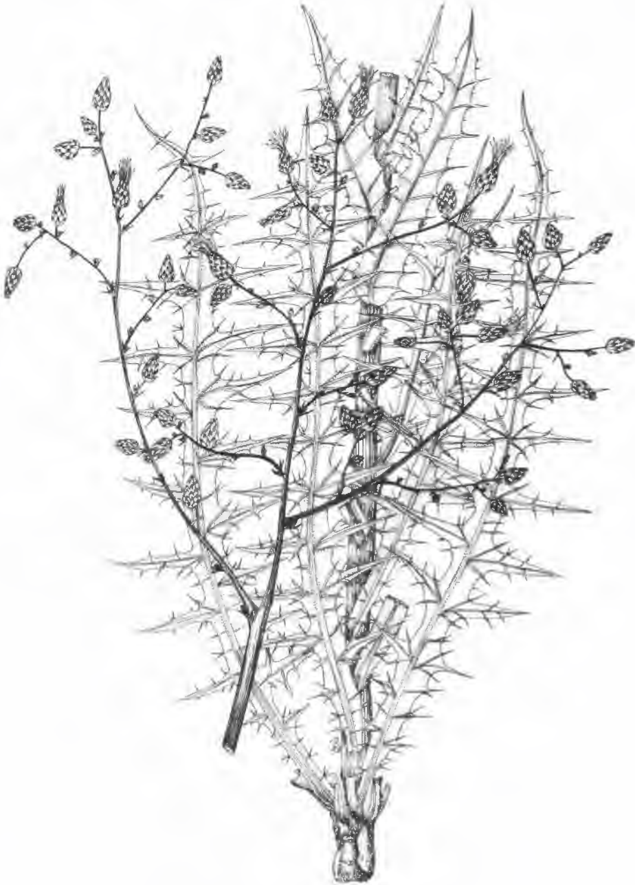
Fig. 2. Cousinia raddeana ( \times 0.5 ).