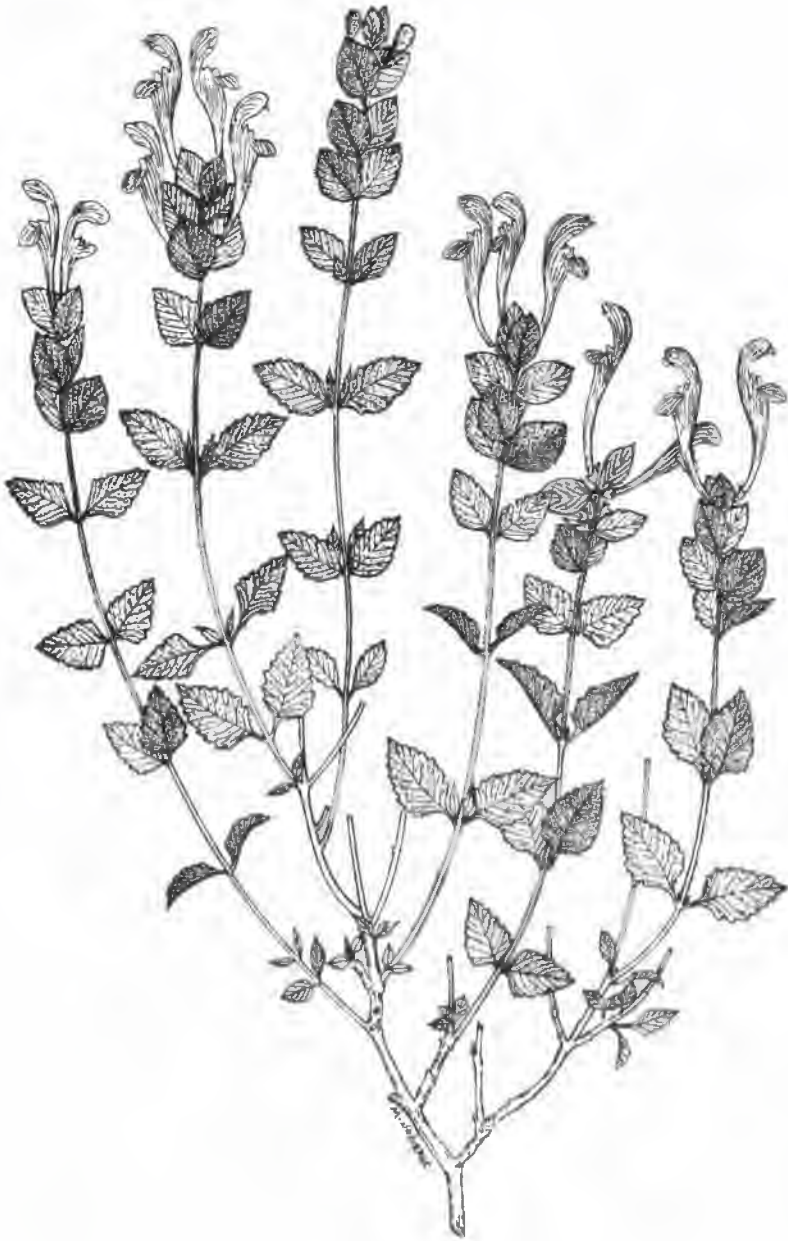
Fig. 3. Scutellaria lindbergii ( \times 0.8 ).