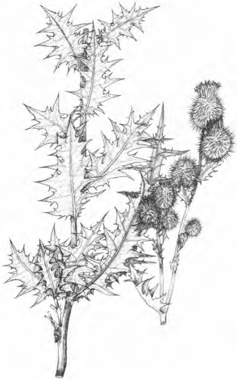
Fig. 1. Cousinia apiculata ( \times 0.5 ).