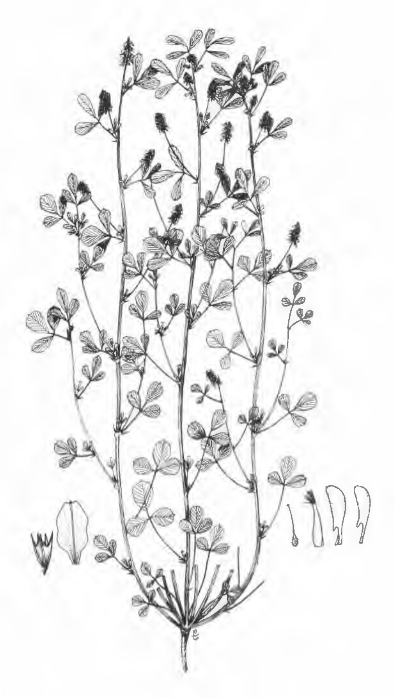
Fig. 2. Melilotus neapolitana ( \times 0.5); flower parts ( \times 3.5).