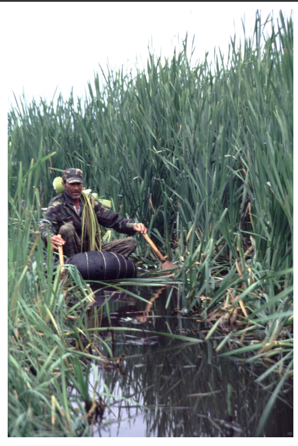
Fig. 2. Local fisherman with a makeshift boat transporting harvested Nymphaea alba , note the dense belt of Typha surrounding the deeper parts of the lake.